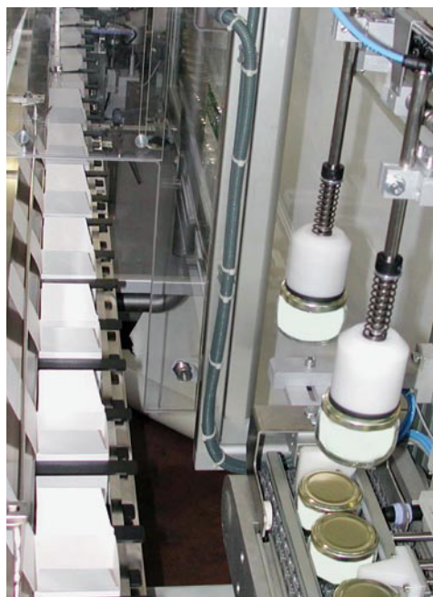
Vial feeding in intermittent mode